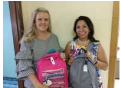
Employees from Alltech help support Stuff the Bus!