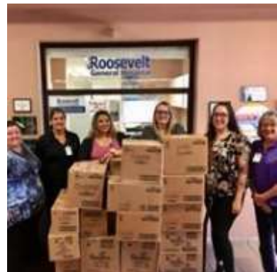
RGH Employees helped collect over 8,000 diapers for local babies!