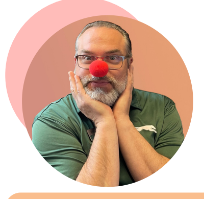
"Fun"raising for our youth.

Providing resources to parents of young children.