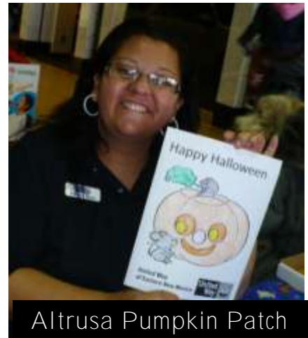
Altrusa Pumpkin Patch

In 2005, the Roosevelt County United Way and the Curry County United Way officially merged to form a combined dual-county United Way. The new dual-county United Way was named United Way of Eastern New Mexico (UWENM) in March of 2005. Over our history, United Way of Eastern New Mexico has invested over $11,000,000 into the community, providing vital services to our neighbors-in-need in both counties.