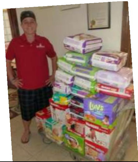
Live United Day