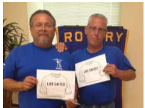
Caught Living United