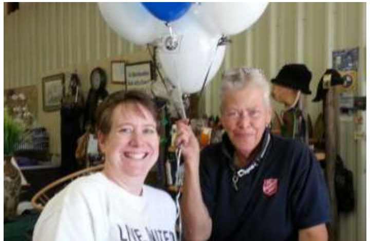
Celebrating our Agencies