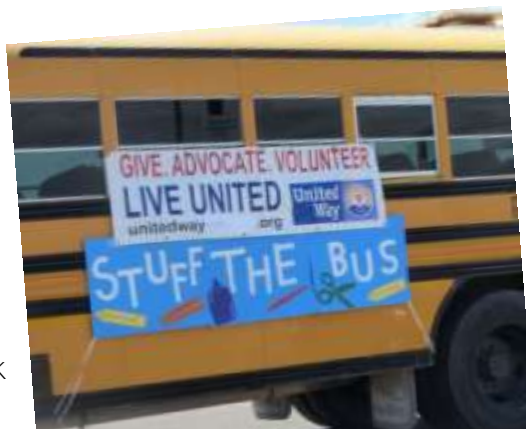
Stuff the Bus